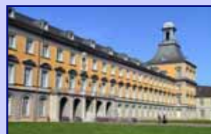
University main building

in cooperation with the Universitätsclub Bonn