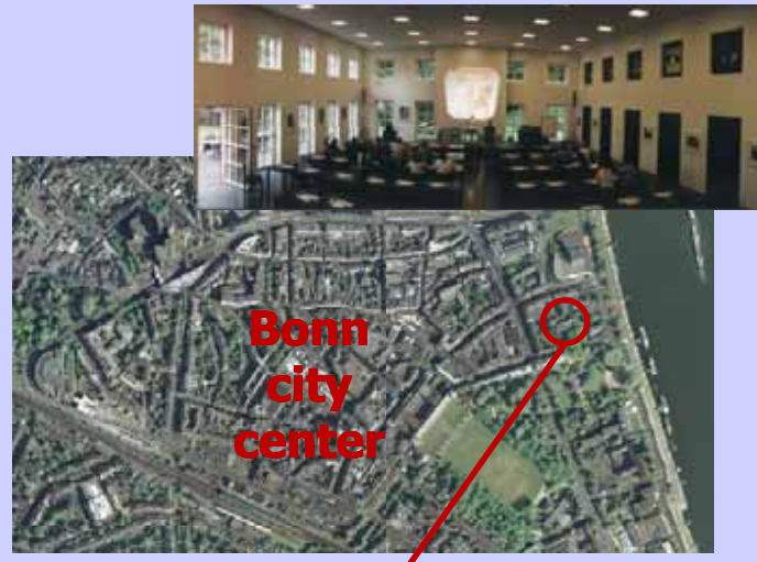
Workshop location: Universitätsclub

Built on Roman foundations, the „Universitätsclub Bonn“ is located in the city centre (Konviktstr.9), close to the main university building, the railway station and the river Rhine. The workshop location can easily be reached by public transport and from Cologne/Bonn airport, which is also regularly approached by many budget airlines throughout Europe.